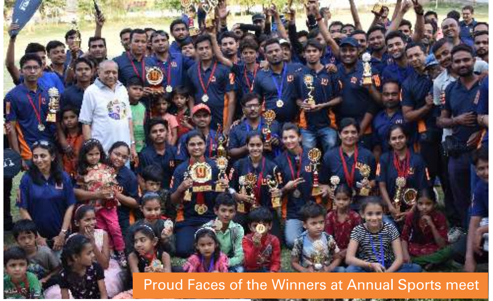
Proud Faces of the Winners at Annual Sports meet