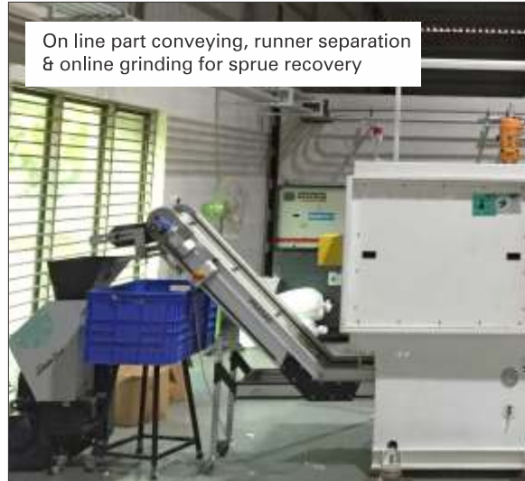
On line part conveying, runner separation & online grinding for sprue recovery

Prasad Group has range of conveyor belts to offer exact solution for Part handling & automation in IMM & BMM. These conveyors with auxiliaries like Carousels & separators are manufactured in India in joint venture with CRIZAF SP - Italy.