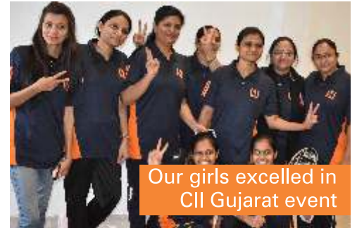
Our girls excelled in CII Gujarat event