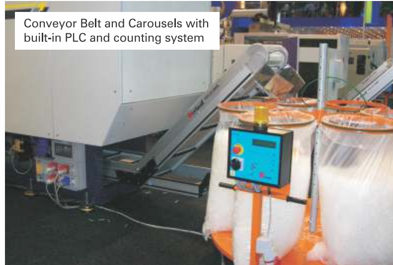
Conveyor Belt and Carousels with built-in PLC and counting system