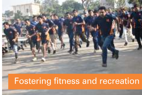
Fostering fitness and recreation