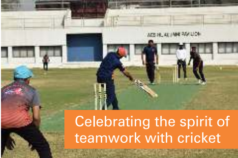
Celebrating the spirit of teamwork with cricket