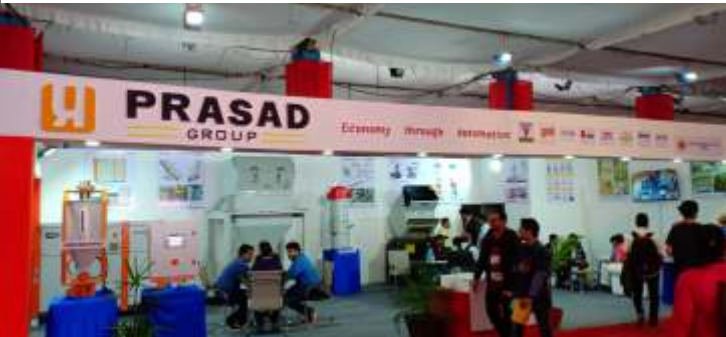
Nepal Plast, Nepal