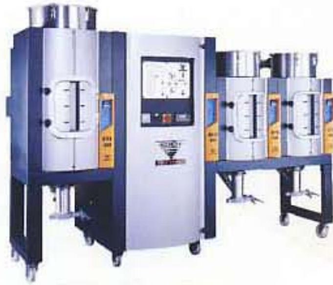
EKO - Next Generation energy efficient drying system