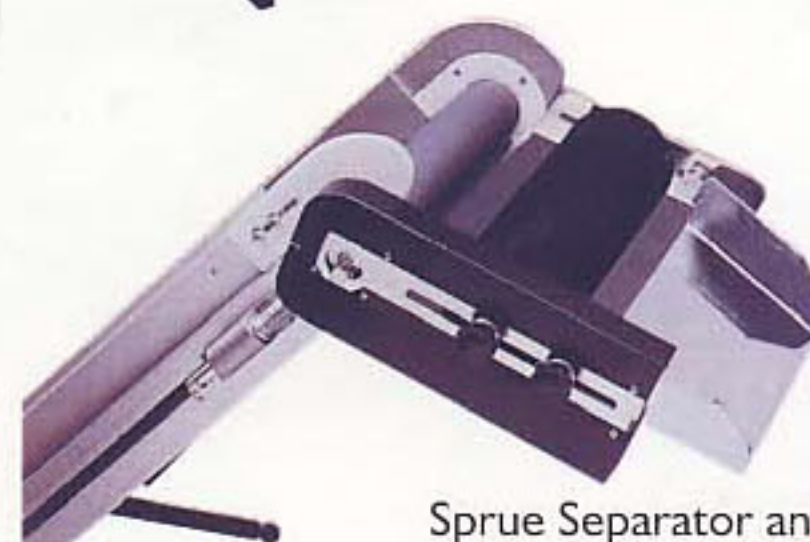
Sprue Separator and Conveying