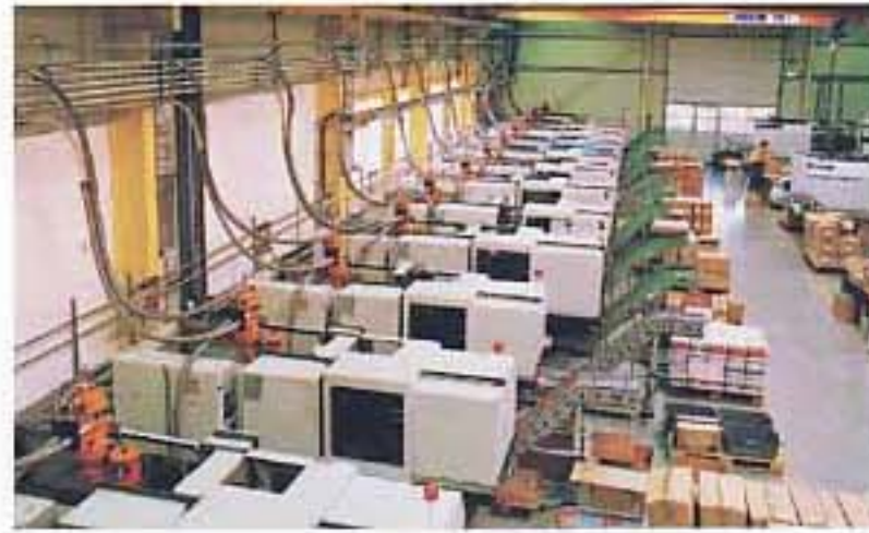
Central Conveying System with multiple material combinations