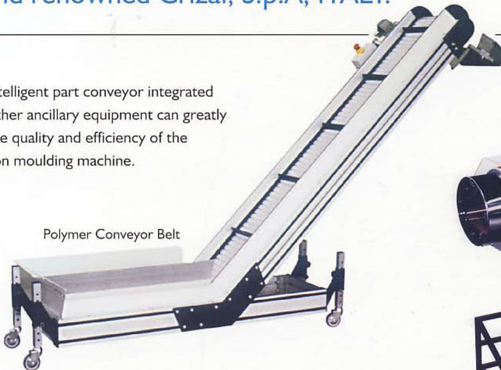
Polymer Conveyor Belt

This intelligent part conveyor integrated with other ancillary equipment can greatly increase quality and efficiency of the injection moulding machine.