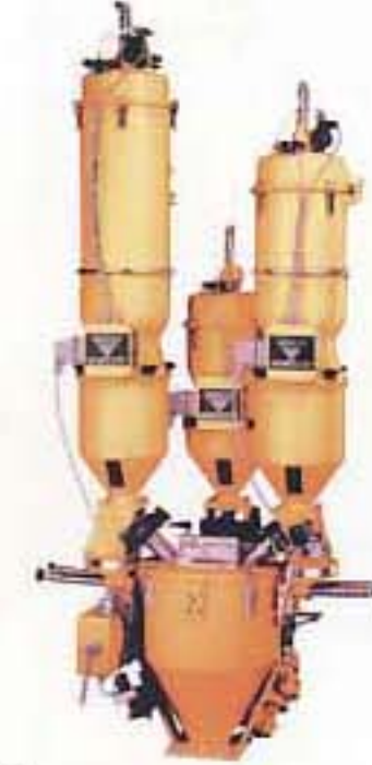
Highly accurate gravimetric blending system