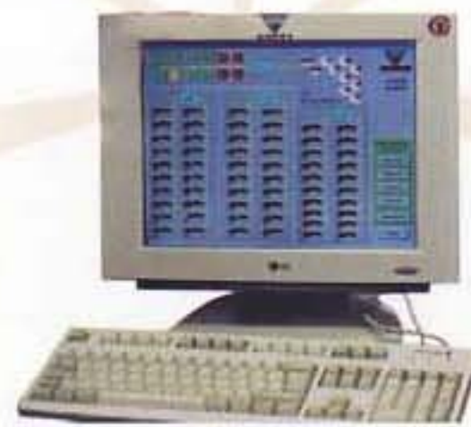
SCADA Total material management central console with PC & Mobile Connectivity