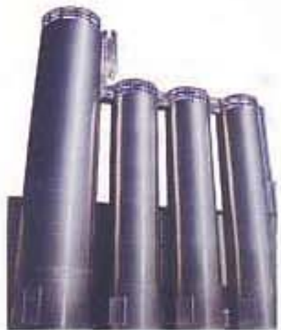
Silo & Silo feeding system