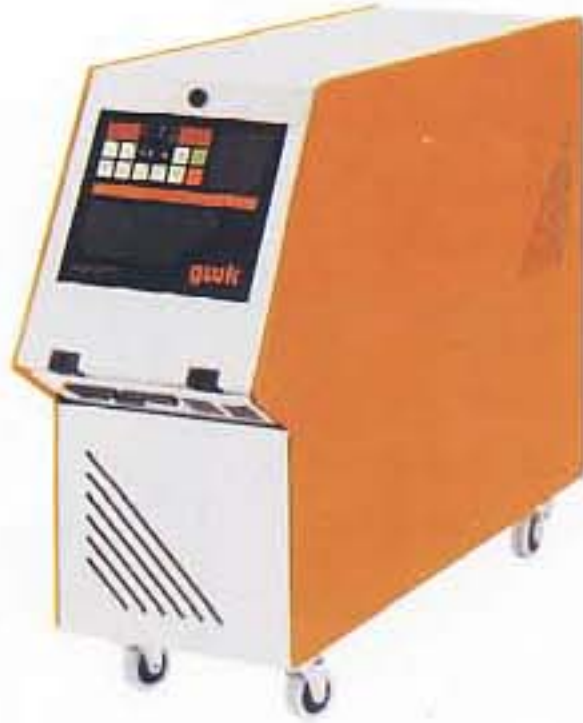
Mould Temperature Controller