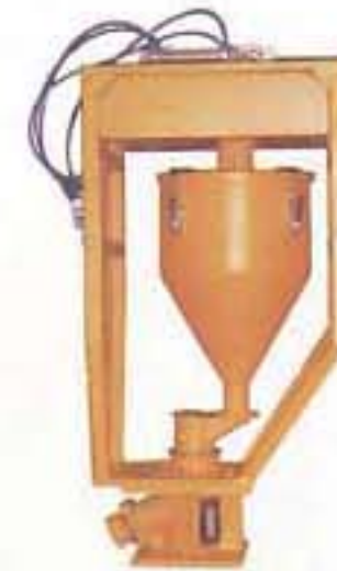
Gravimetric Extrusion Process Control with perfect GSM control

Prasad Koch-Technik in India has total solution from raw material emptying from truck to drying and from master batch dosing to conveying on machine.